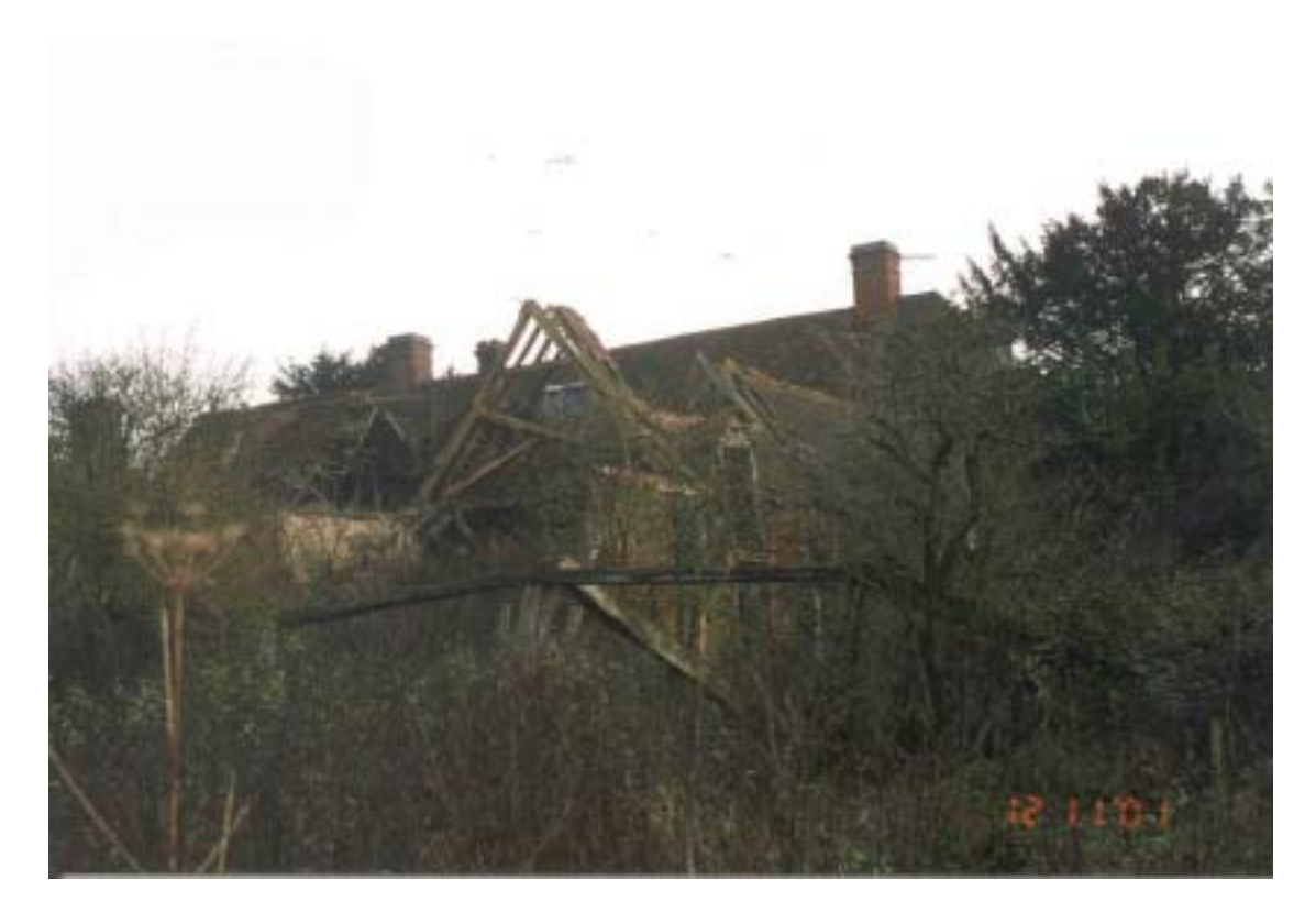
5 External view of South West Range of Stables