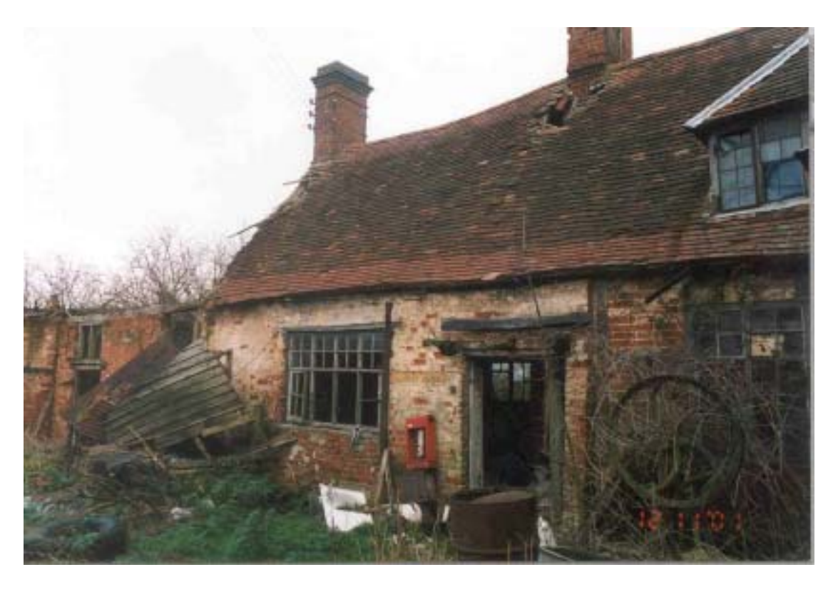
4 Inner elevation of North East Range – Brewhouse and entrance to Dairy

3 Inner elevation of Rear Range – coach house – before roof collapsed