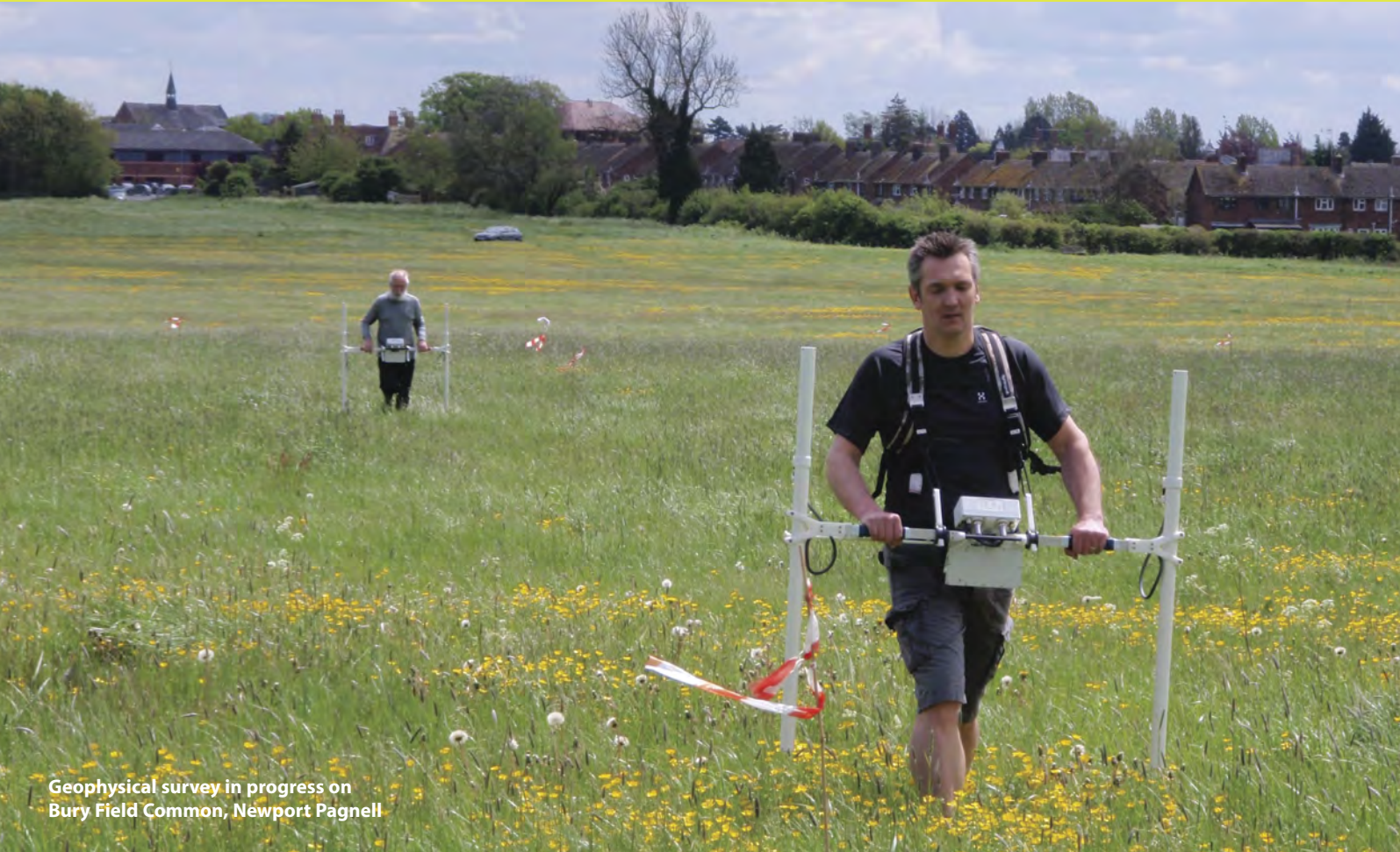
Geophysical survey in progress on Bury Field Common, Newport Pagnell

Milton Keynes Central Library, Saturday 9th November 2013