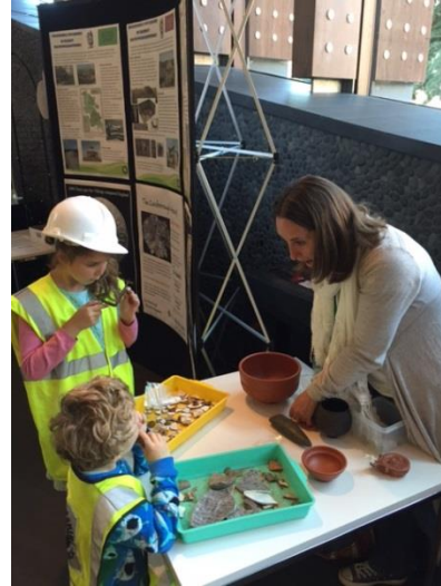
Public open day at Stone excavations