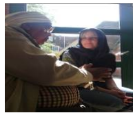
Outreach advice & support