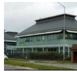
South Bucks Council offices