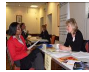
County Funding Fairs