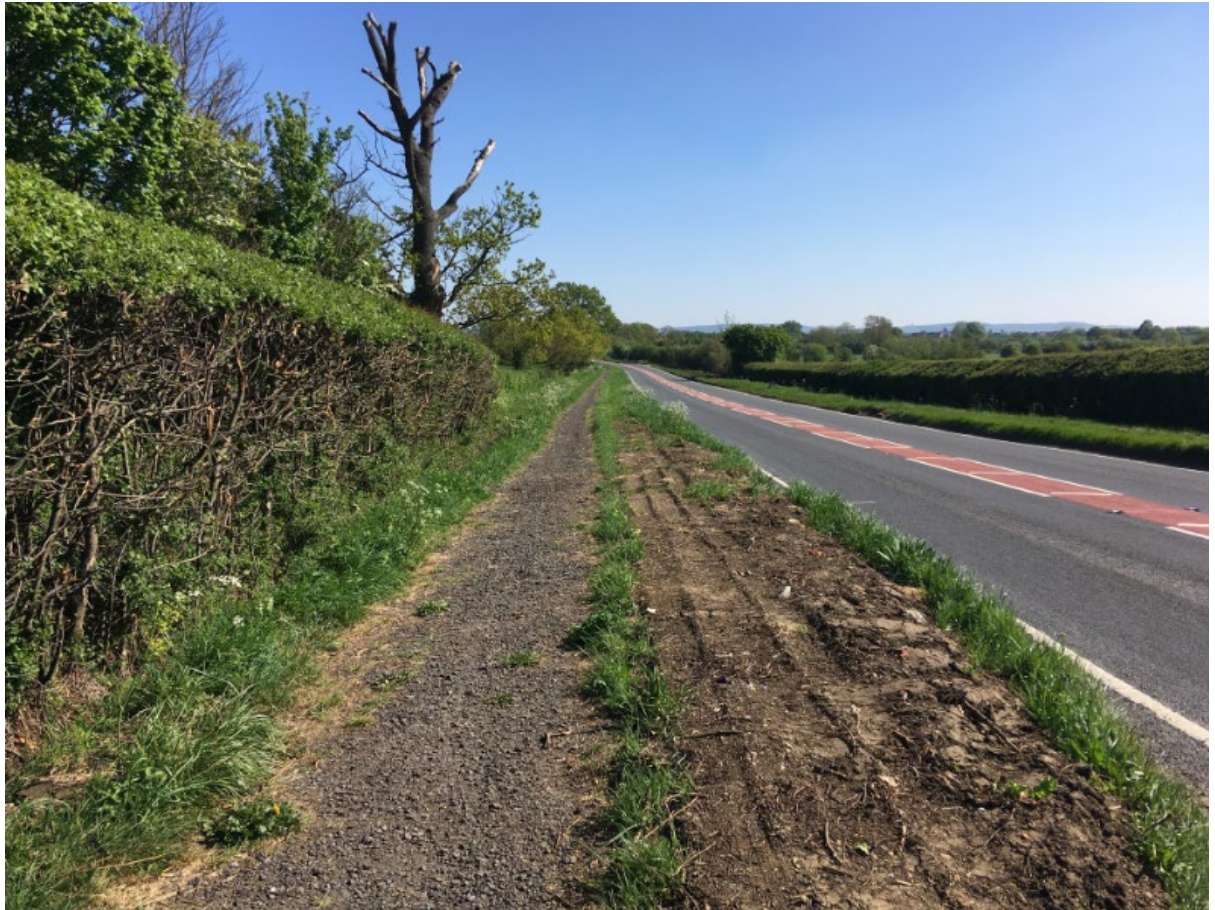
A413 walking and cycling route

The cost of upgrading this 1,700m long route would be around £318,000. A part or full contribution would be of great benefit to Aylesbury residents, albeit communities in the immediate Hulcott and Rowsham areas may not benefit directly.