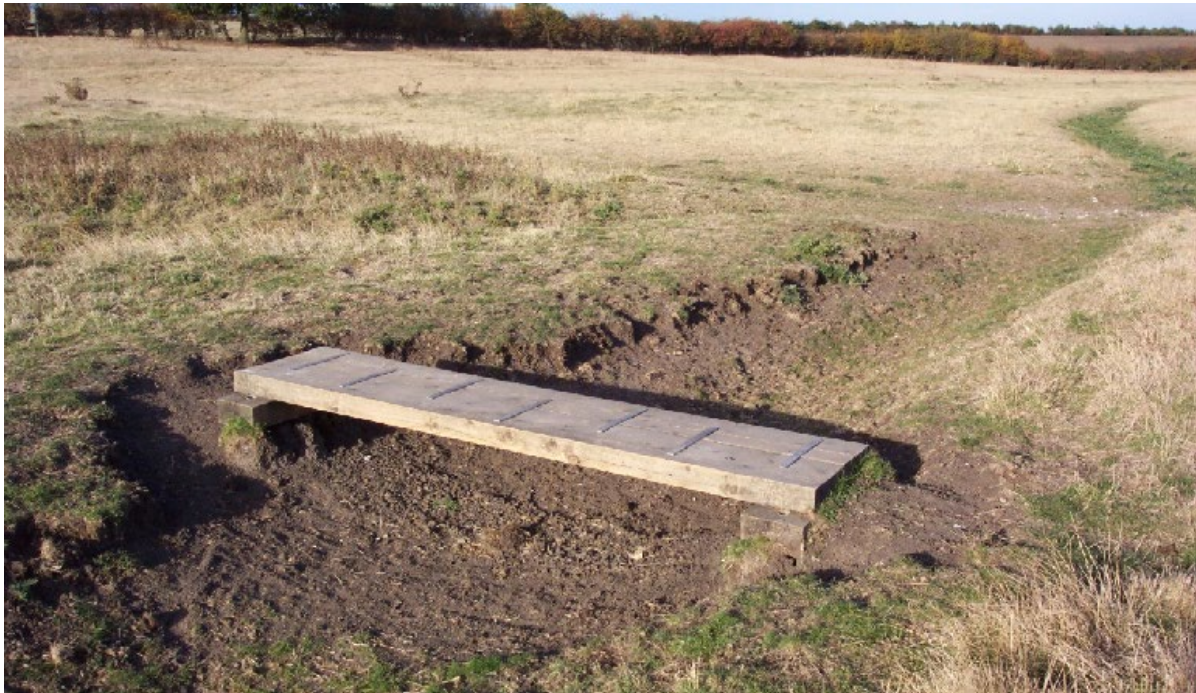
Small sleeper bridge

Pictures of both bridges are shown below, where improvements would allow 'access for all' at a combined cost of £30,000.