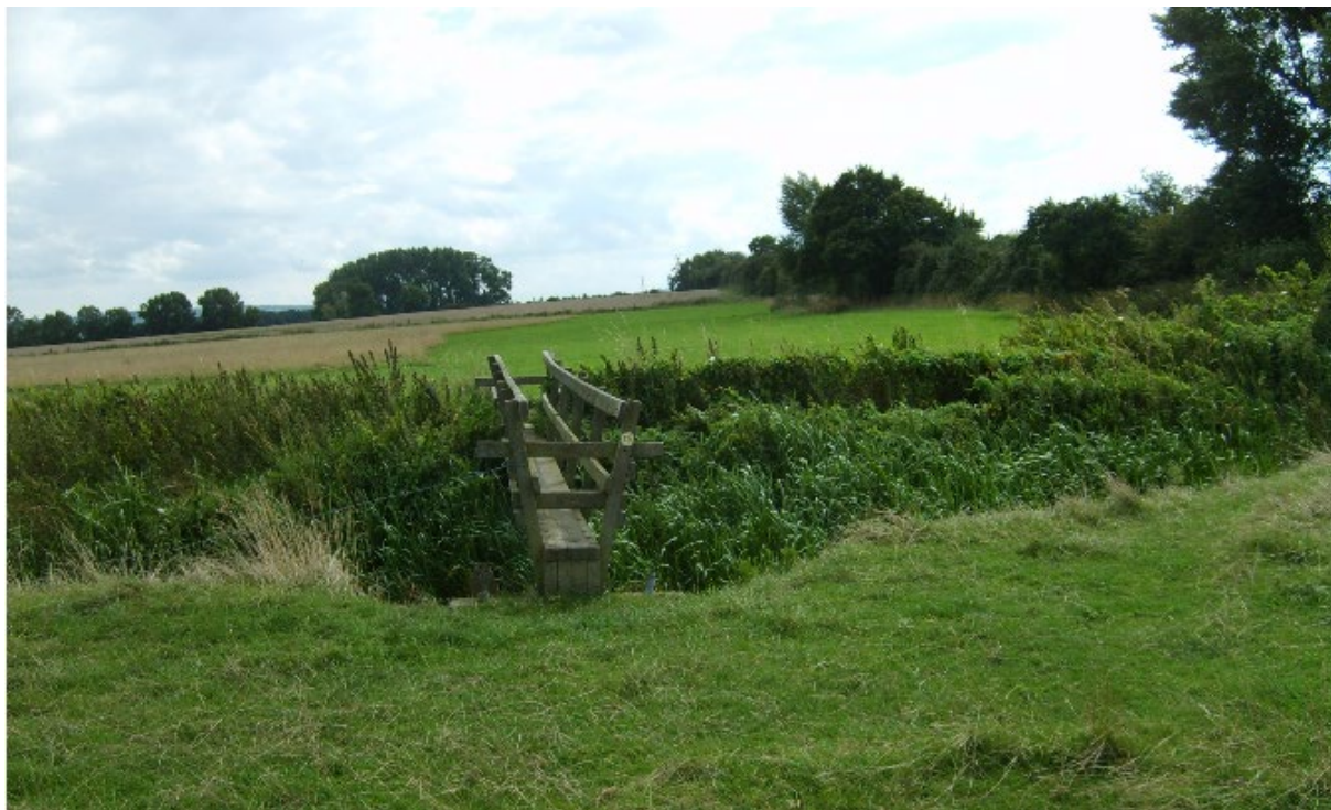
Main Thame River bridge