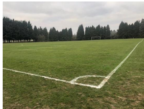
The Team and the local football pitch