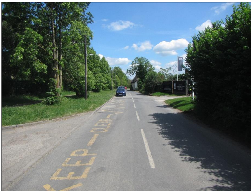
Figure 1 Looking in an easterly direction from the school entrance towards the proposed give way lines for the priority narrowing in line approximately where there are parked cars on the left.

I am aware of the location and made a site visit on the 9 th June at 13.00hrs, the weather was fine and dry and the traffic was light. The picture below shows the approach past the new development on the right, the give way lining for the feature will be approximately where the parked vehicles are on the left hand side in the opposite lane.