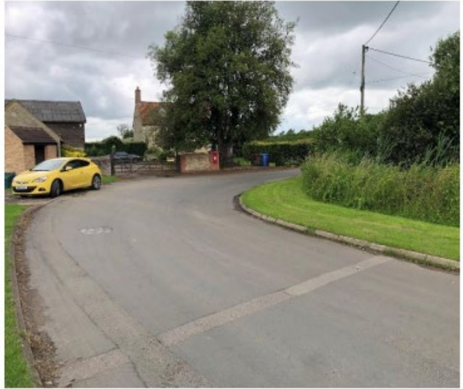
The two 90-degree bends with narrowing of road through Fencott