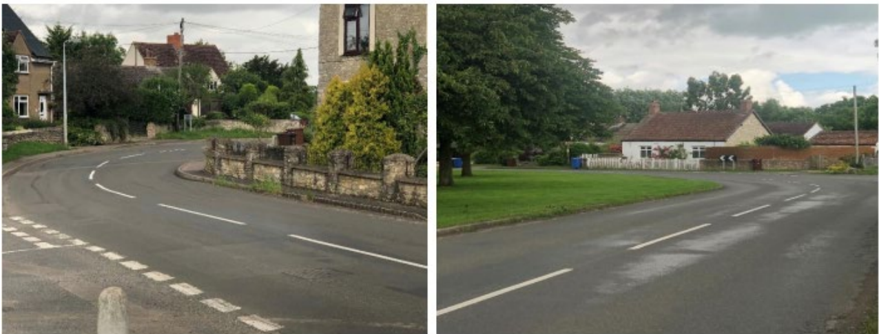
The two 90-degree bends with narrowing of road through the centre of Arccott Village

2.3.2 A proposed route via Ambrosden and Arccott has been suggested by the developers, but without published consultation, both these villages are justifiably submitting objections to this proposal given they already have traffic calming schemes, school entrances and children's playgrounds adjacent to the highway, we understand they are canvassing Cherwell and Oxfordshire authorities to support their objections. It is a surprise that Buckinghamshire Highways have not acknowledged any consultation with these parties within their report. We note the submitted traffic plan is highly selective in the photographs used, omitting photographs of the two tight bends in Arccott from Plan 6 of the Transport Assessment.