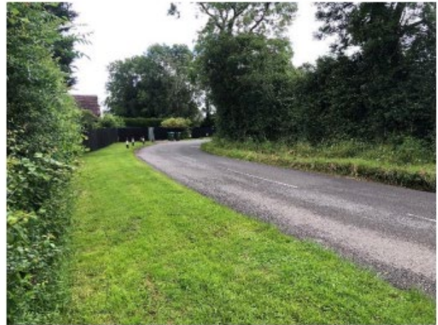
Some of the narrow roads through Murcott